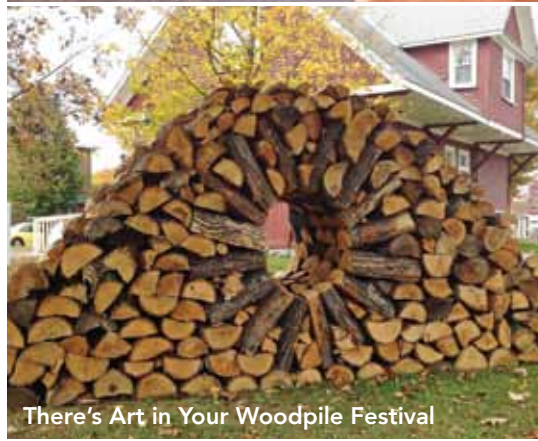
There's Art in Your Woodpile Festival